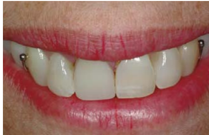
Removable Partial Dentures