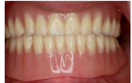
Complete Or Full Dentures