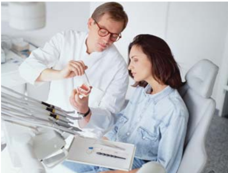
Advances In Science and Technology Offer Improved Options For Replacing Teeth